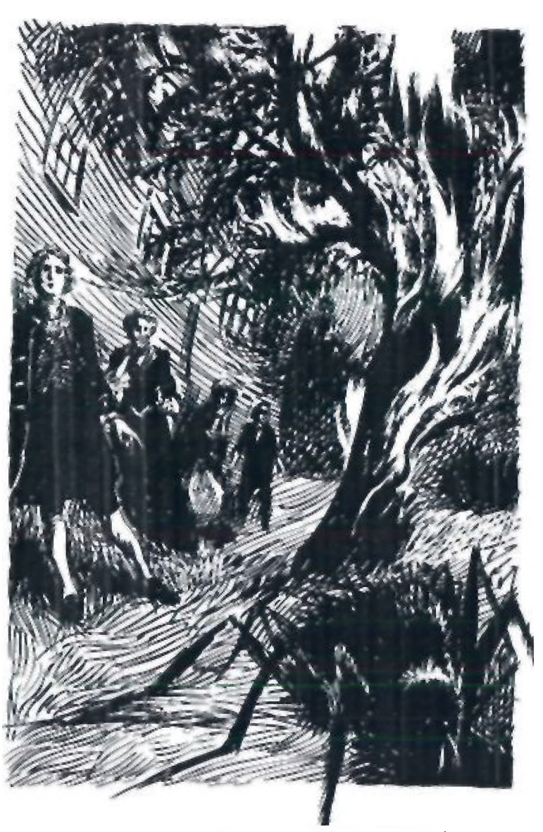
As the tree started to burn, the crowdf saw an animal run from the tree.