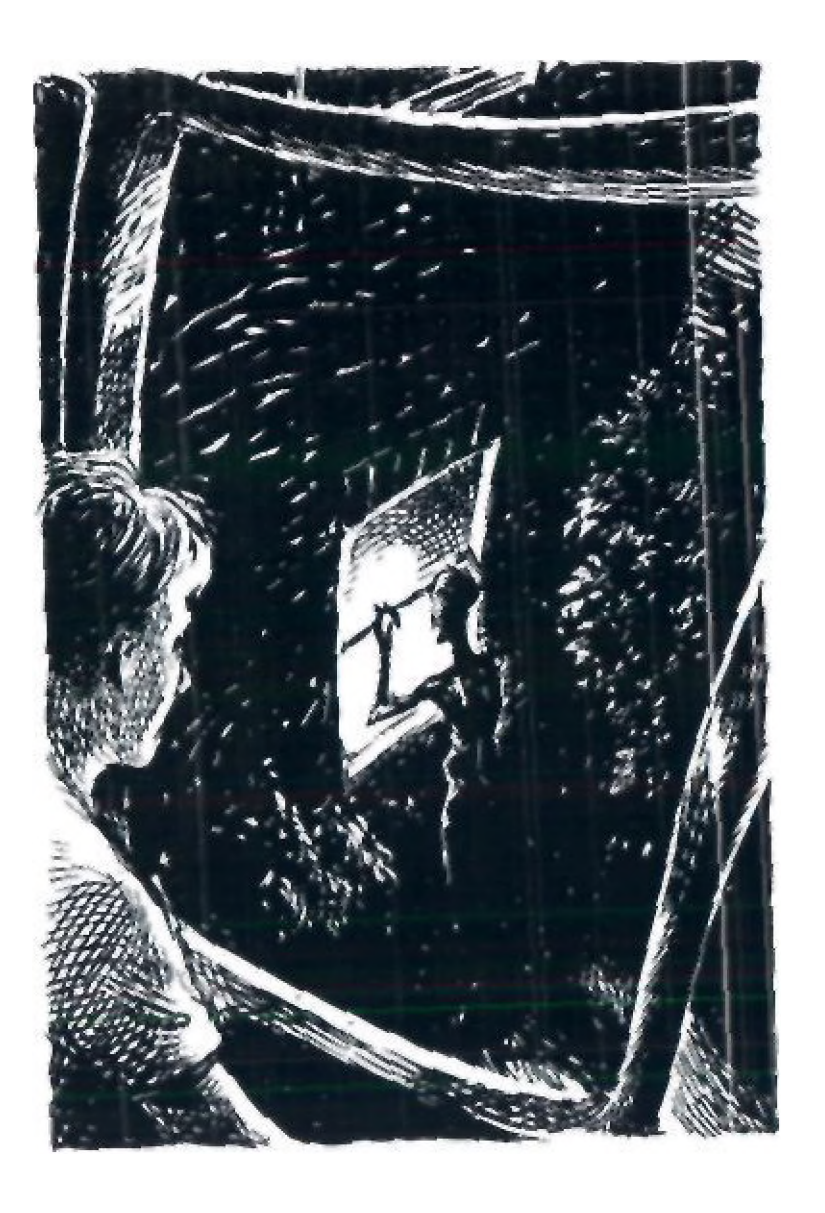
There was a terrible-looking man standing just outside Sampsons window.'