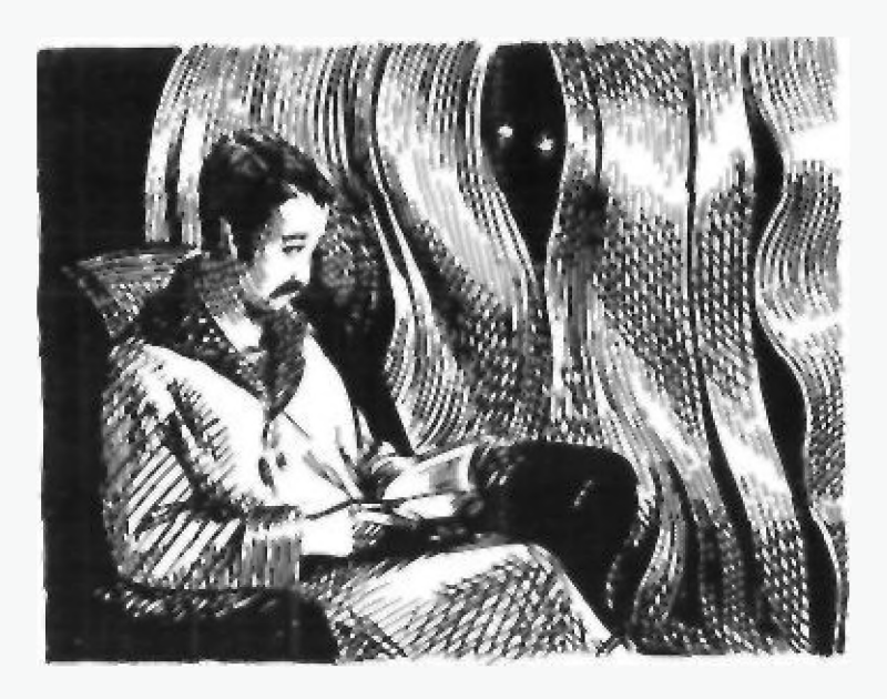
James, though, did not want to go to bed immediately and sat in the chair by the fire in his room, reading.

few weeks later, the curtains were ready and a man came to hang them in several rooms of the new house, one of which was James's bedroom. That night he found that he could not stop looking at them and, although it was a still night, he was almost sure that the curtains were moving and that someone was watching him from behind them. He told himself that this was impossible and not to be so stupid. He explained to himself that the effect was caused by the curving lines on the curtains, which looked just like long, curling black hair.