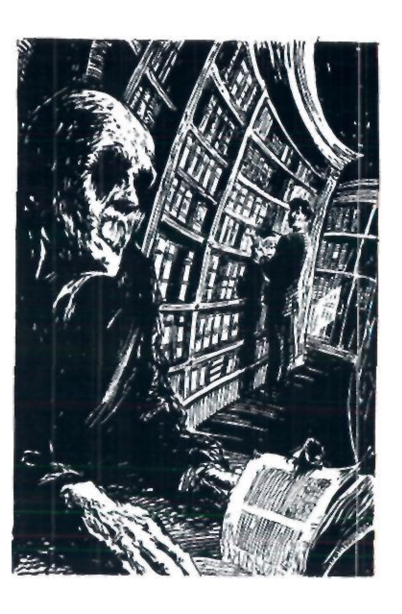
'When he turned round I saw his face \dots and he had no eyes!'