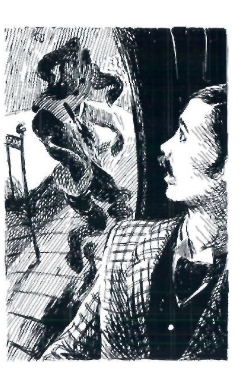
He turned toga, but suddenly something moved behind him.