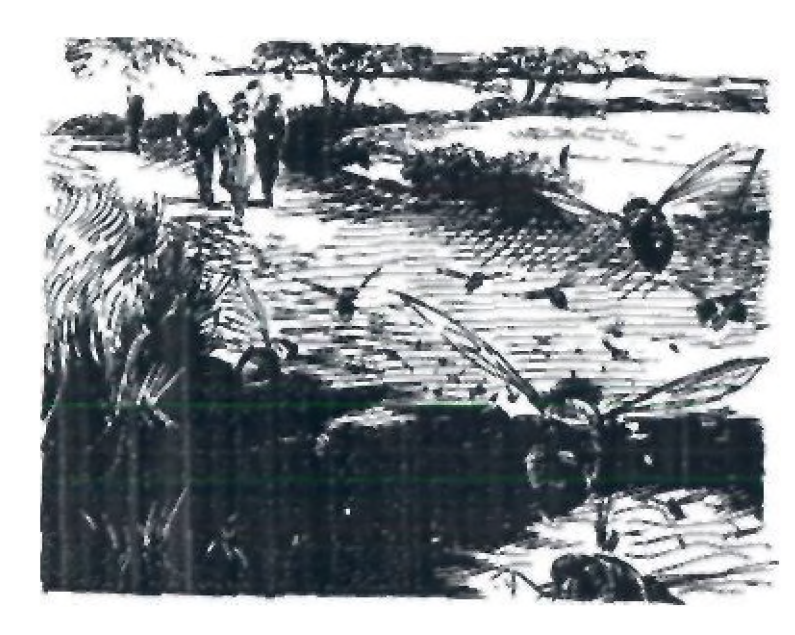
In the blood there were fat black flies, feeding.

So twelve men covered the two bodies in black and took them to a place outside the village. There they dug a big hole, threw the bodies into it and covered them with stones. People say that