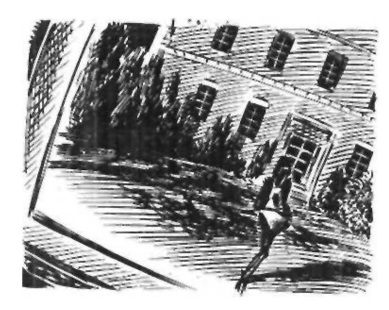
The strange, bony person was now back in the picture, walking away from the house and, in its long, thin arms was a baby.

they came back again and by now the person was gone and the house looked quiet and calm again in the moonlight.