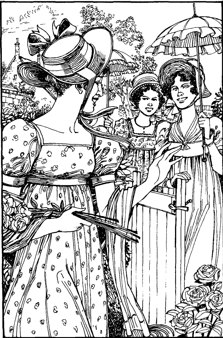
Anne liked the Cottage, with its garden of flowers and fruit trees.