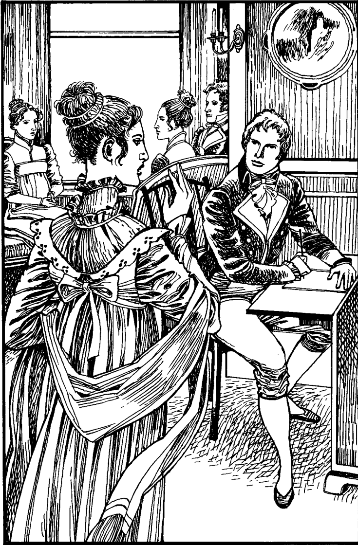
Captain Wentworth was there, at a desk in one corner of the room, writing a letter.