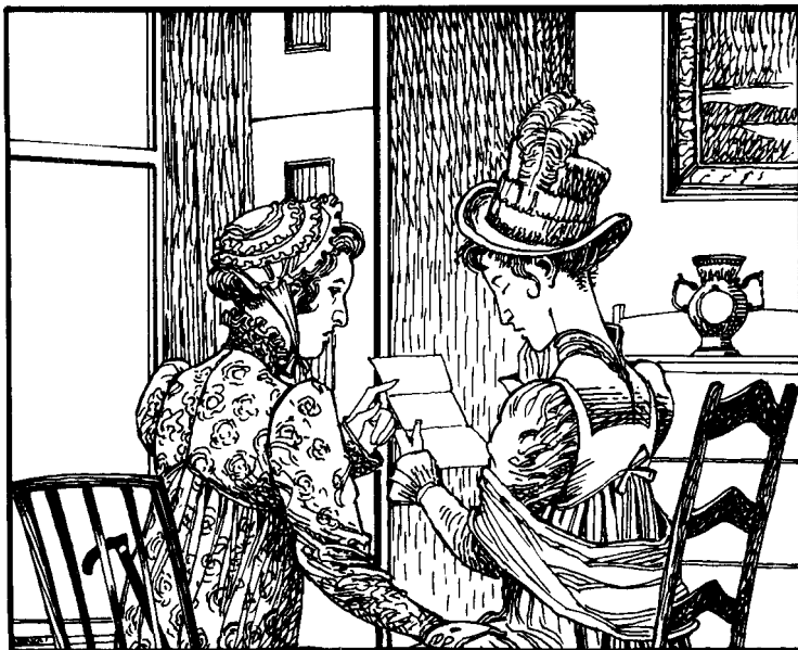
Her friend's story was all true. Mr Elliot was a very bad man.

Anne listened to Mrs Smith's story and she read some