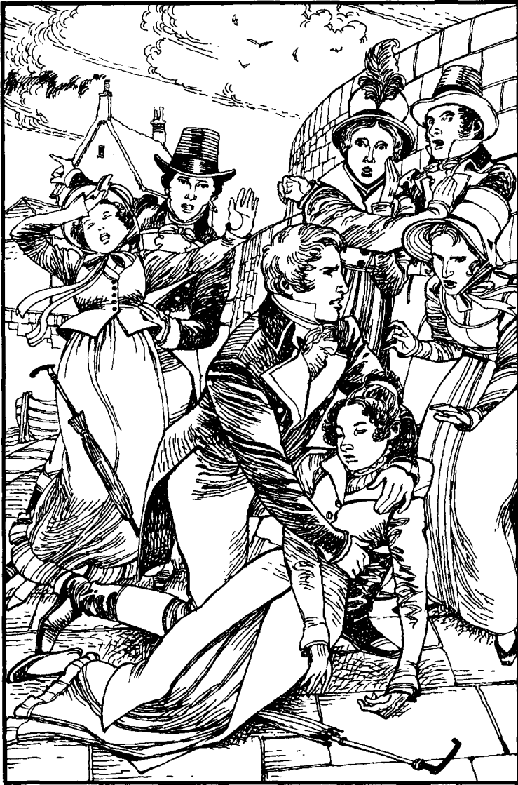
Captain Wentworth took Louisa's head in his arms.