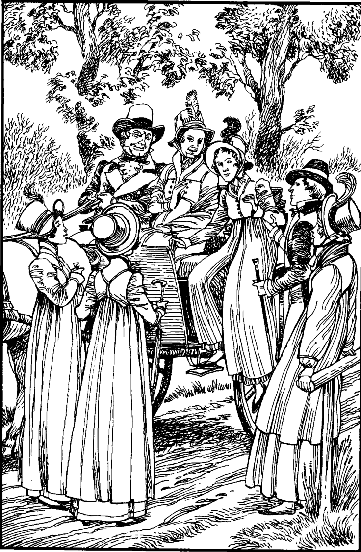
Without a word, he took her arm and helped her up into the Crofts' little carriage.