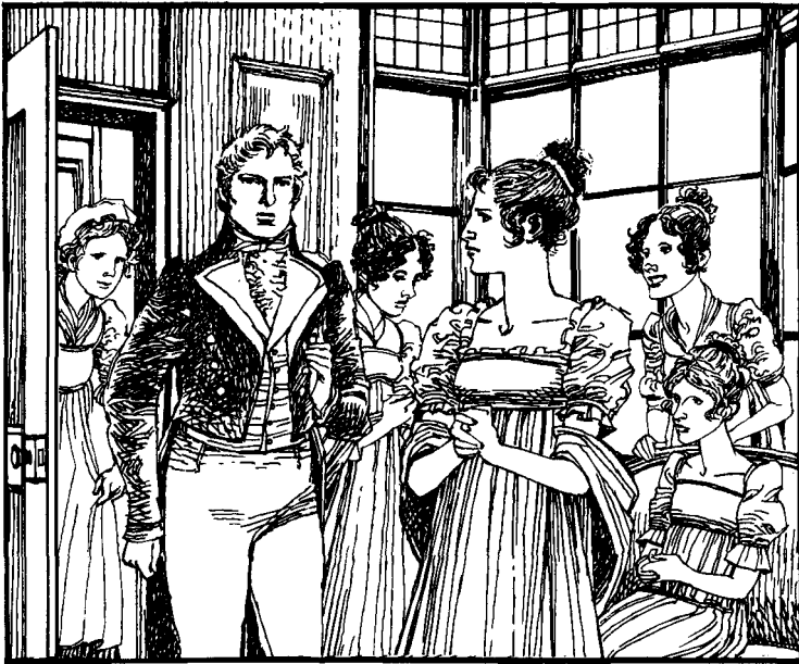
He came in, her eyes met his, he gave a small polite smile.

Charles and Mary went to the big house for dinner, too. Anne stayed with their two children at the Cottage. So Charles and Mary met Captain Wentworth for the first time. Charles invited him to visit them the next day at the Cottage and so it was there that Captain Wentworth and Anne met again after more than seven years.