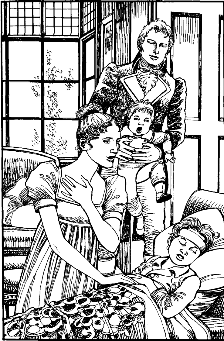
Captain Wentworth walked across the room, took the child off her back and carried him away.