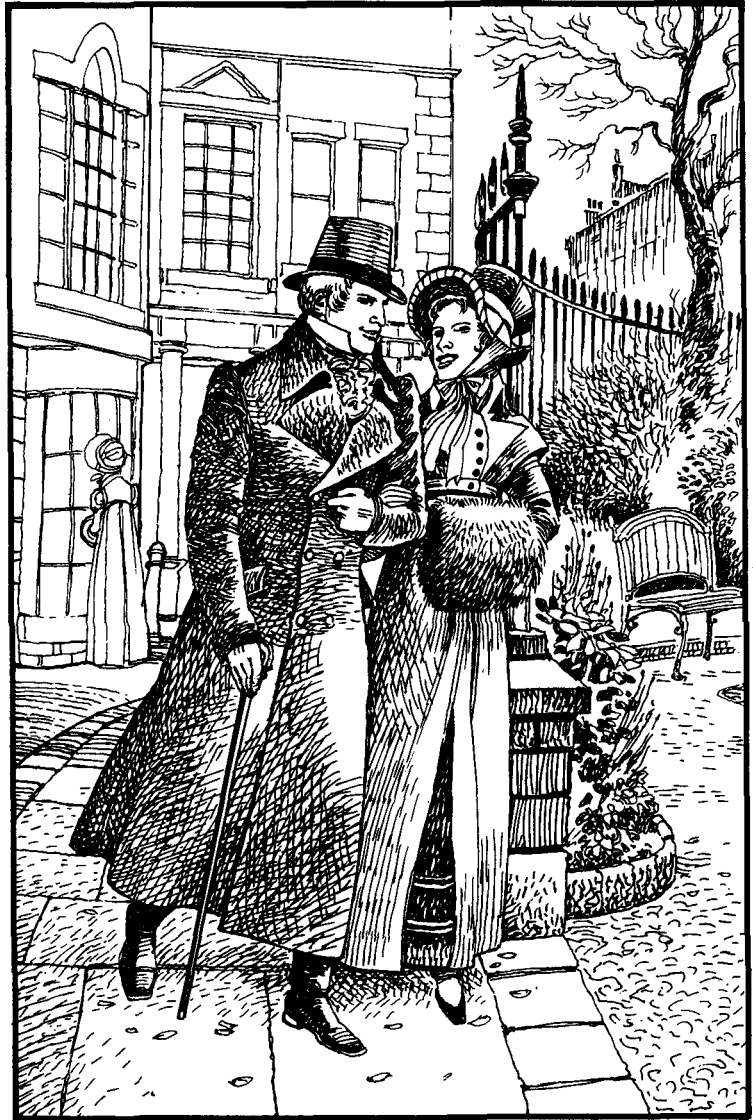
They talked about the love they now knew they had.