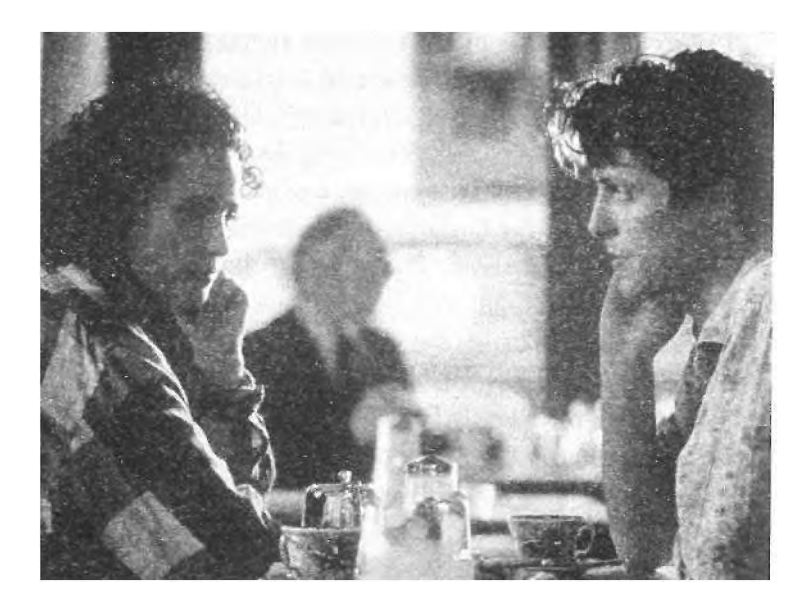
Carrie and Charles both stop talking. There is a very serious, silent moment; something has happened, and they both feel it.

Carrie laughs. And suddenly, they both stop talking. There is a very serious, silent moment; something has happened, and they both feel it.