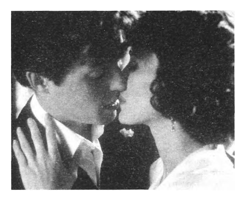
Carrie kisses Charles on the mouth.

where the groom can kiss the bride. I might not stop at kissing —' 'How far is too far?' asks Charles, coming very close to her.