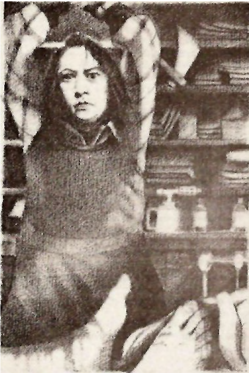
She seized the axe in both hands and moved her feet so that she was standing firmly on the floor.