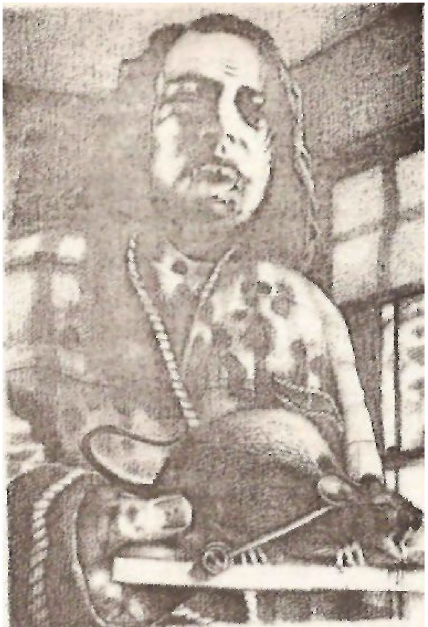
In her other hand was a rat-trap. There was a large grey rat in it. The trap had broken the rat's back.