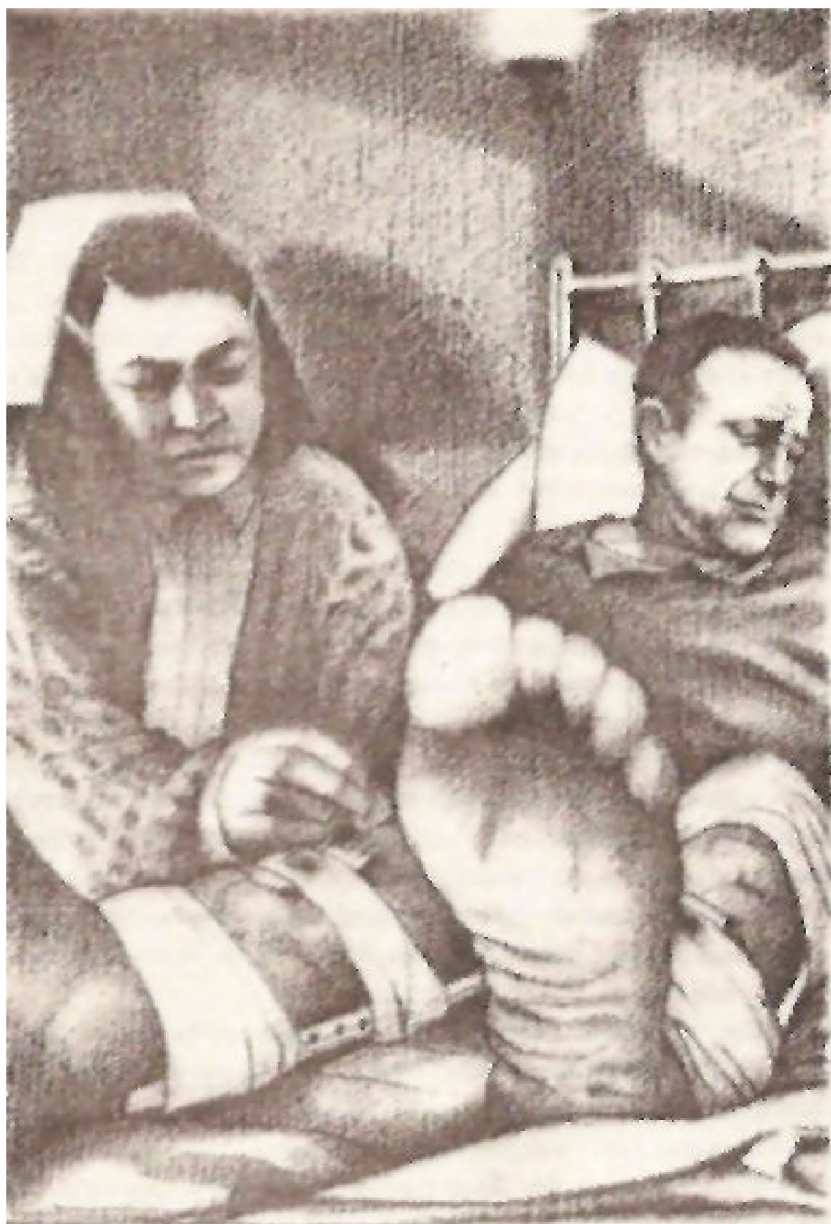
She had tied splints firmly and cleanly on to both legs.